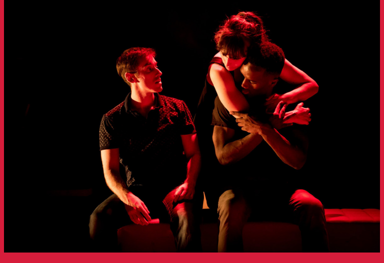
"THOUGHT-PROVOKING FROM START TO FINISH"